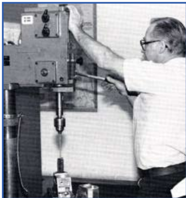
Operator prepares to deburr part for a hydraulic tool at the ENERPAC Butler Wisconsin facility.